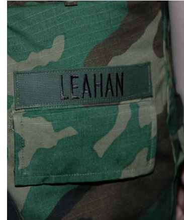
Right rear trouser pocket patch