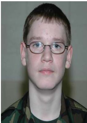
Front Facial View Male