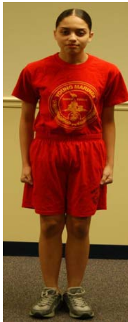
PT Figure 2-3