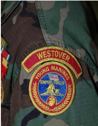
Left shoulder patches

e. Chevrons . Rank insignias are worn on both collars of the camouflage blouse, khaki shirt or field jacket. They are placed vertically with the single point up and center of the insignia on a line bisecting the angle of the point of the collar. The lower outside edges of the chevron are placed 1/2 inch from the edge of the collar. During events above the Unit level, Young Marines should wear chevrons on their camouflage cover. The chevron will be centered top to bottom, left to right on the front of the cover.