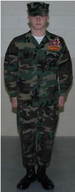
Full Camouflage Figure 2-1