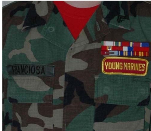
Front blouse patches and ribbons