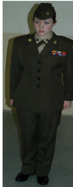
Service A Figure 2-4